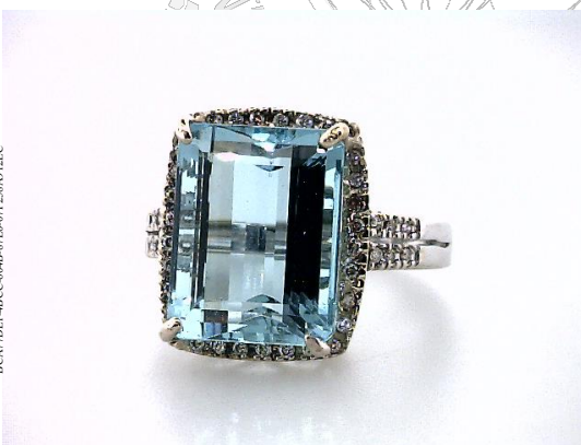
Images of the gemstone or jewelry piece(s) should not be taken as an actual representation of the color, clarity, or brilliance. It should only provide an identification of shape, cut, and/or relative size and may only be an approximate representation to the item in reality. The photo(s) may also be reduced or enlarged in size.